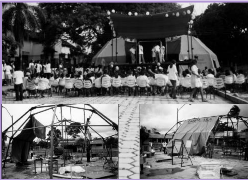
The Lilac Tent serves as a catalyst for community mobilization.

introduced RH as an effective way to reduce maternal mortality in Bolivia, which was the highest in Latin America.