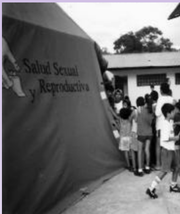
Lining up for entertaining education.

La salud reproductiva esta en tus manos . . . ahora mas cerca de ti. Reproductive health is in your hands . . . now much closer to you.